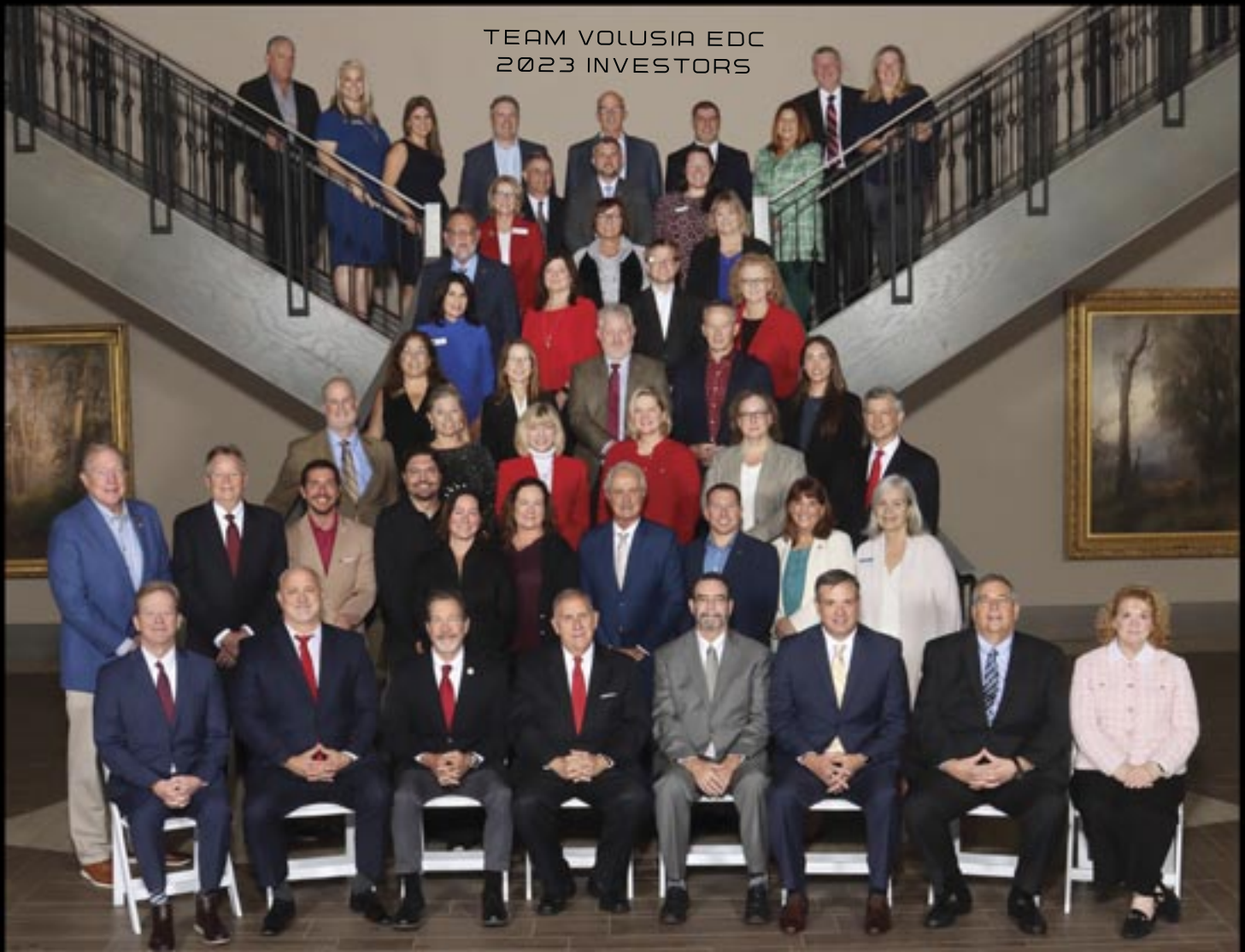
TEAM VOLUSIA EDC 2023 INVESTORS